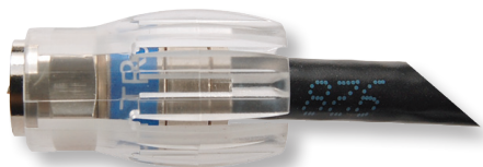
PCT-JS (Shown installed onto a PCT-JTRS6LA jumper.)