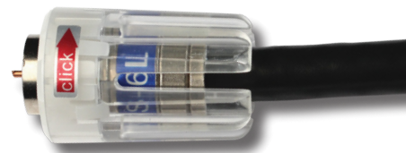
PCT-TS (Shown installed onto a PCT-JTRS6LA jumper.)