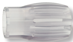
PCT-JSU (Works on various connector lengths.)