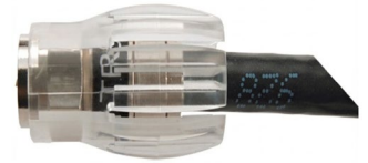
CX-JS (shown installed onto CONEX jumper)