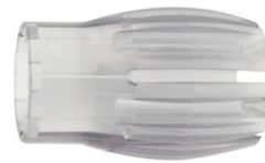
CX-JS Jumper Sleeve