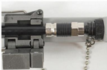
ERS-6 connector / RG6 coaxial cable