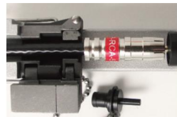
59 connector / RG59 coaxial cable