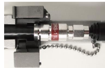
DRS-11L connector / RG11 coaxial cable