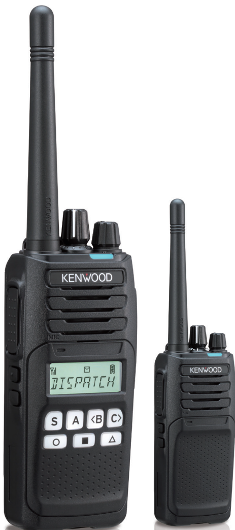
Standard Keypad model

If you are thinking of harnessing the latest digital protocols – NXDN or DMR – to enhance business efficiency or FM analog for its simplicity, the NX-1200/1300 has you covered. Our One-“K”-Fits-All solution offers the widest selection of two-way radios for everyday use. The model matrix also includes basic and keypad variations, with or without a high-contrast backlit LCD. Other features include a 7-color LED indicator and the popular KENWOOD 2-pin audio accessory connector. Plus, mixed-mode operation ensures seamless integration with legacy radios while smoothing the onward migration path to digital. But whatever your specific needs, audio quality is what determines clear voice communications – which is why KENWOOD radios are used under the most grueling conditions, like the cockpit of a racing car. Thanks to our extensive experience with professional systems, reliability is second to none. So whatever your radio requirements, KENWOOD's NX-1200/1300 offers a single platform that's right for you.