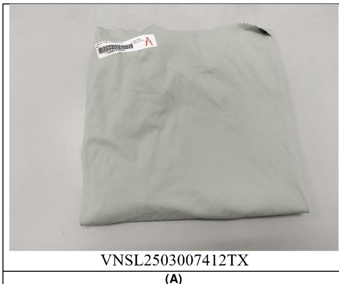
PHOTO OF SUBMITTED SAMPLE

Report results refer to submitted sample(s) only *** End of Report ***