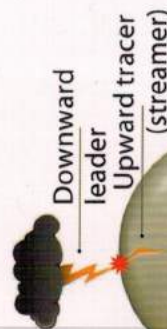
Early streamer emission (ESE) lightning rods

MAKE FREE AND EASY CALCULATIONS WITH nimbus® project